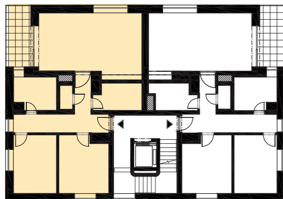
Location of the apartment in the building