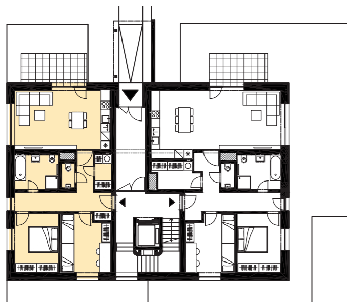
Location of the apartment on the floor