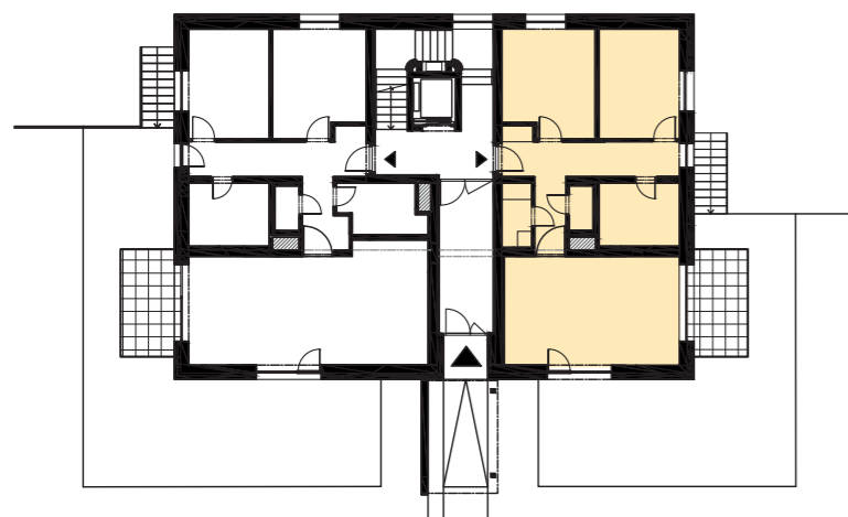
Location of the apartment on the floor