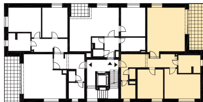
Location of the apartment on the floor