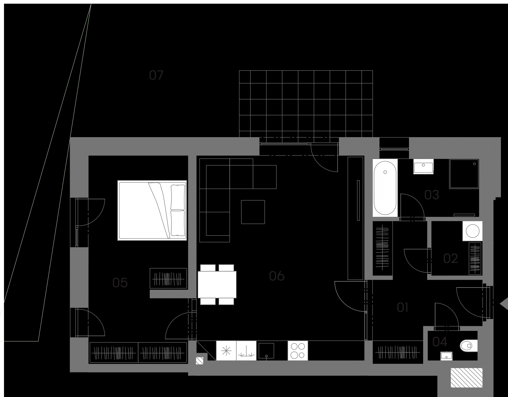
Layout of the apartment