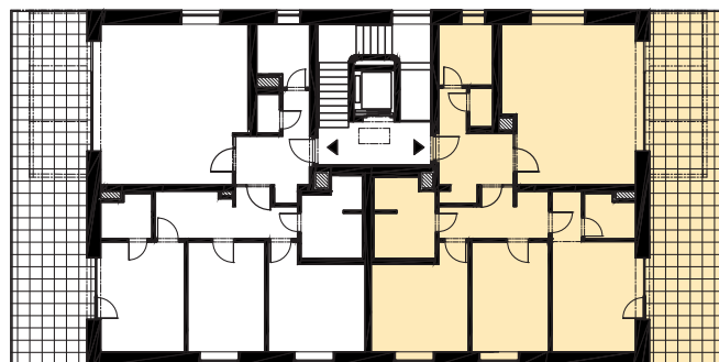
Location of the apartment on the floor