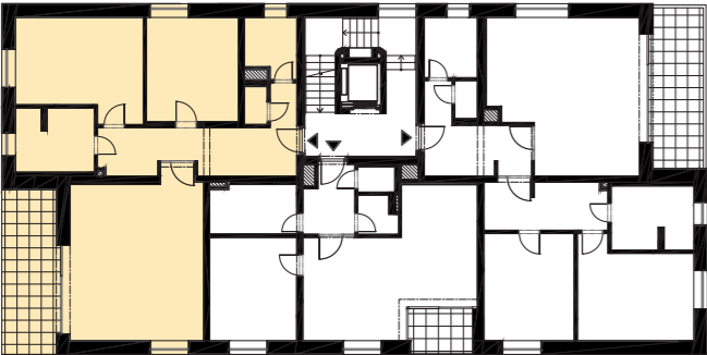
Location of the apartment on the floor