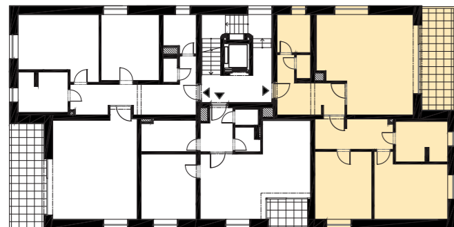
Location of the apartment in the building