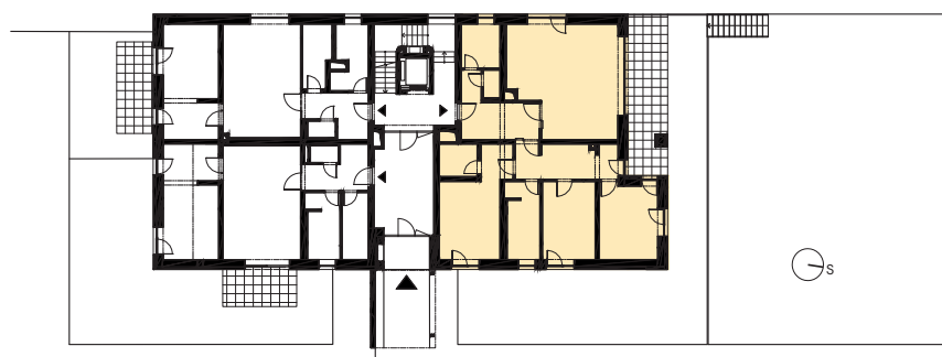
Location of the apartment on the floor