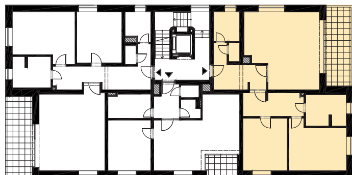
Location of the apartment on the floor